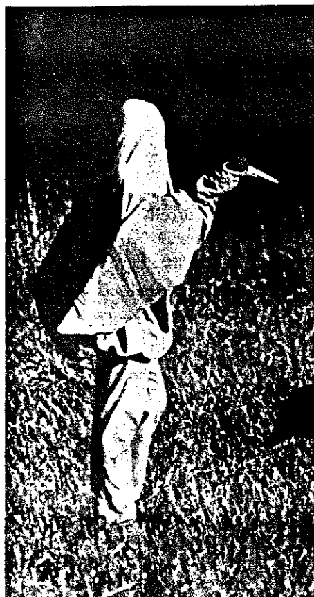
The original costumed figure used in the 1984 pilot study for crane hand rearing techniques.